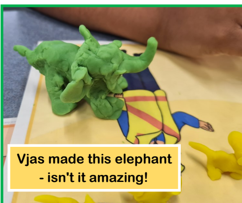
Vjas made this elephant - isn't it amazing!