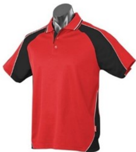
Polo Top $38