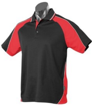
Polo Top $34

We are putting in another order for Senior Uniforms, please phone or email the school to place an order. Please note: items will not be distributed until paid in full or payment plan put in place ie Centrepay.