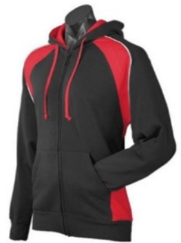
Windcheater - $45

Both garments include – WDSS SENIORS on the back with school logo on the front