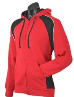
Windcheater - $51

Both garments include – 2021 on the back with all graduating students' names, school logo and first name on the front.