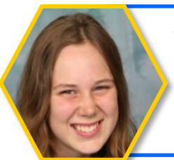
STUDENT LED AWARD - GEORGIA

Being RESPECTFUL - helping others out in the yard and asking if they are ok