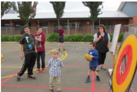
TARGET game - Students earned points for their team for hitting the target.